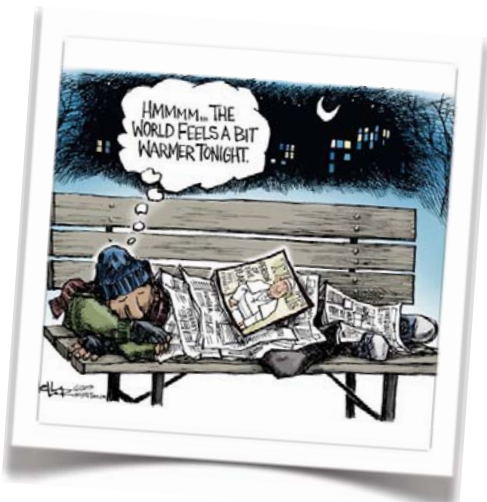
“walk thou in my footsteps”

Pope Francis inaugurated the Extraordinary Jubilee Year of Mercy. It began on the feast of the Immaculate conception 8 th December 2015. It extends to the feast of Christ the King, 20 November 2016.