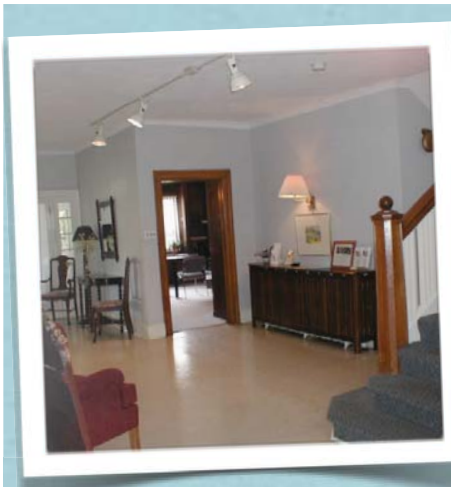
the Dining Room

They have been posted to all parishes in the Archdiocese, to the retreat captains and they are on our Manresa web-site.