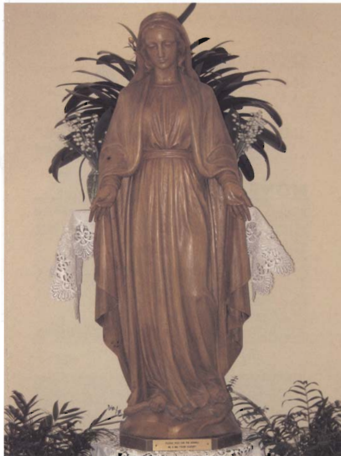
Our Lady Mary in St. Ignatius Chapel