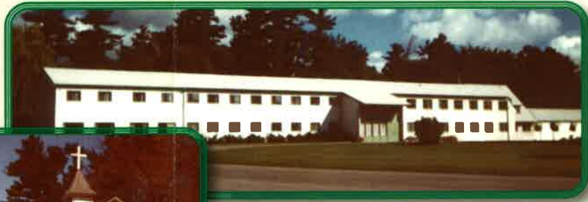
The Chapel and Fleming Hall today