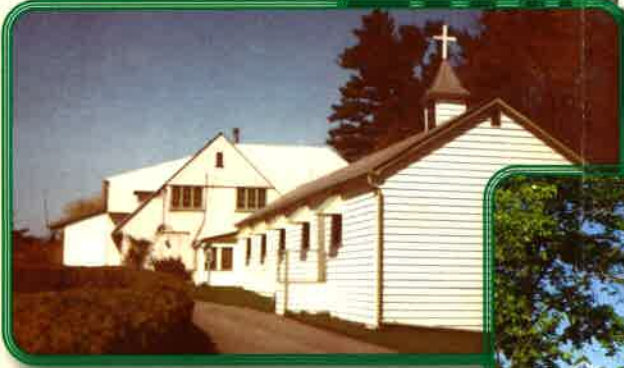
The Chapel and Fleming Hall in days gone by...